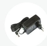
24V 1.2A Adapter